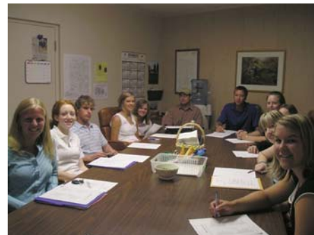
Pictured Above: The Intern Advisory Committee, at a biweekly meeting, preparing for the Intern BBQ and working on the Intern Newsletter.

Economic Development Corporation is being recognized statewide for this program and for its commitment to invite our youth to look at a county that does have "Acres of Opportunity."